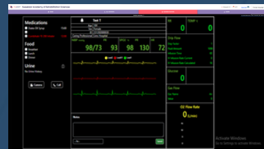
RICU - Station